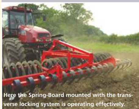
Here the Spring-Board mounted with the transverse locking system is operating effectively.