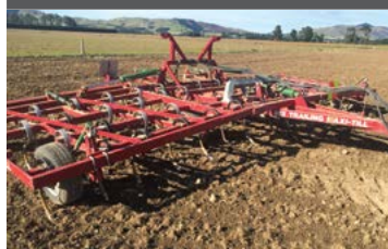
RATA $22,000* Heavy duty cultivator

6.3 metre with cambridge roller packer rings.