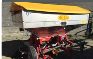
BREDAL $17,500* F2 2500 (2008)

Stainless bin and cover. Great condition.