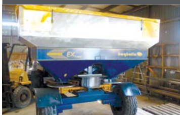
BOGBALLE $25,995* EXW Trailed Spreader

Load cells and full electronic control. Immaculate condition.