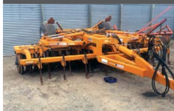
SIMBA $19,995* 4,6 Cultipress

2 rows of tines, levelling boards and 600mm DD ring roller. Tidy machine easily towed with 120Hp.