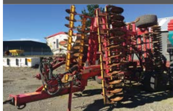
VADERSTAD $49,995* TopDown 600 (2008)

Load cells and full electronic control. Immaculate condition.