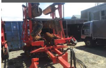
QUIVOGNE $23,500* 630 Disc Roller

6.3 metre with cambridge roller packer rings.