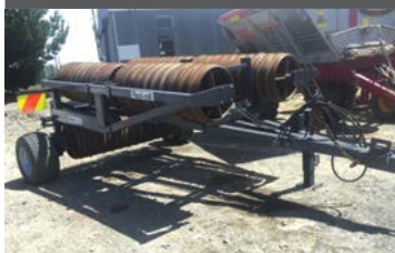
FLEXI COIL $18,995* Folding Roller

Sand blasted and repainted, Machine in excellent condition.