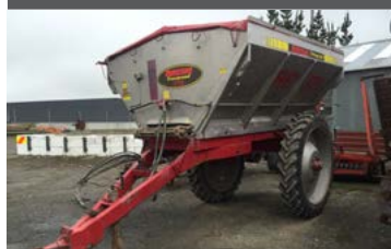
ROBERTSON $33,500* Transpread 770

Very tidy unit. Spread tested and ready for work.