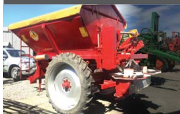
BREDAL $45,000* K65

New floor belt and fully refurbished. Looks like new.