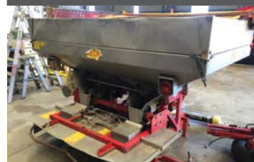
BREDAL $10,500* B2XL (2001)

2 rows of tines, levelling boards and 600mm DD ring roller. Tidy machine easily towed with 120Hp.