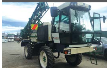
HOUSEHAM $100,000* AR300

Best machine on the market. Fully serviced.