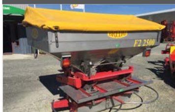
BREDAL $25,995* F2 2500 (2013)

Stainless bin and cover. Fantastic condition.