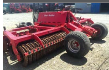
HEVA $39,995* 5.0m Disc Roller