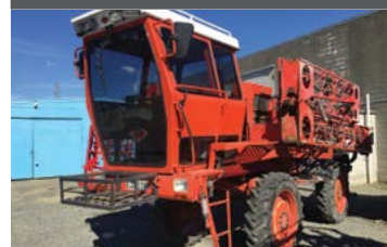
SAM $59,995* Self Propelled Sprayer

24m boom, 3000lt spray tank, twin line, 4 wheel steer. Approx 8646 hours.