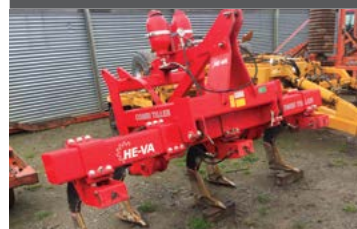
HEVA $17,500* Combittler 3.0