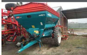
SULKY $39,995* DPA XLT trailed fertiliser spreader

5 ton capacity. Extremely tidy precision spreader.